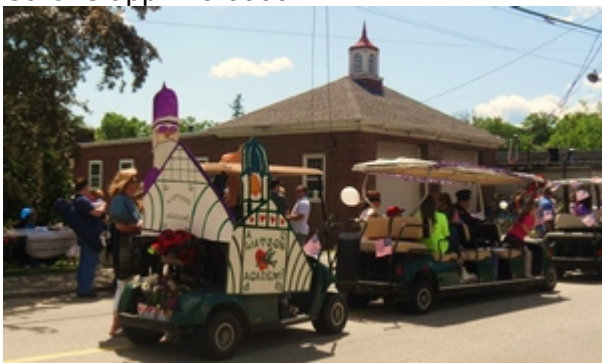
Save Watson float in Memorial Day parade